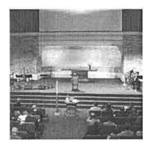
Celebration Worship uses a praise band and the order of worship and song lyrics are projected on the wall. [9 & 10:30 a.m. Sundays and 6 p.m. Wednesdays in the New Celebration Center on the west end of the church]

Traditional Worship follows a liturgy and the music centers around the organ and piano. The order of worship is inserted into the bulletin. [9 a.m. Sundays in the Sanctuary on the north end of the church; 1:30 p.m. Wednesdays in the Sanctuary]