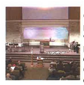
Celebration Worship uses a praise band and the order of worship and song lyrics are projected on the wall. [9 & 10:30 a.m. Sundays in the Celebration Center on the west end of the church]