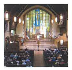
Traditional Worship follows a liturgy and the music centers around the organ and piano. The order of worship is inserted into the bulletin. [9 a.m. Sundays in the Sanctuary on the north end of the church.]

WORSHIP We believe that all instruments, all voices and all people should praise the Lord. We do not worship a "style," we worship Jesus.